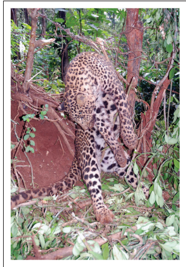
Figure 1. A Dead Leopard in a Wire Snare.

Our study area comprises the state of Karnataka (191,791 km 2 ), southern India, with its 30 administrative districts and 176 subdistricts or taluks. The land cover in the state comprises of forests, agroforestry plantations,